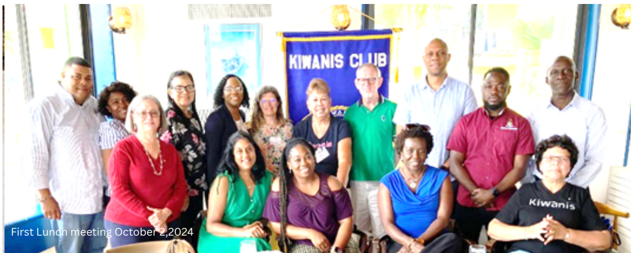
First Lunch meeting October 2, 2024